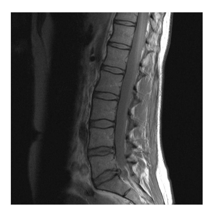
Figure 1. On this T2 weighted sagittal image, note the large free fragment of L5-S1 nuclear material lying within the vertebral canal and extending posteriorly to the lamina-spinous process junction.

No x-rays were taken. However, lumbar MRI was taken on 09-07-06. The report stated "medium sized, left sided central disc protrusion noted at L5-S1. There is a large disc extrusion at L5-S1 into the left lateral recess. Disc bulging at L4-5 and central canal stenosis at L5-S1". Study the following MRI study and the read of each. This is a very large free fragment.